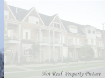
Not Real Property Picture