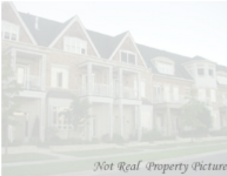
Not Real Property Picture